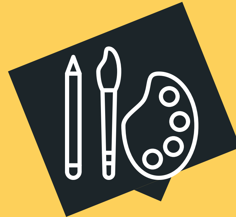
Art, craft and creativity