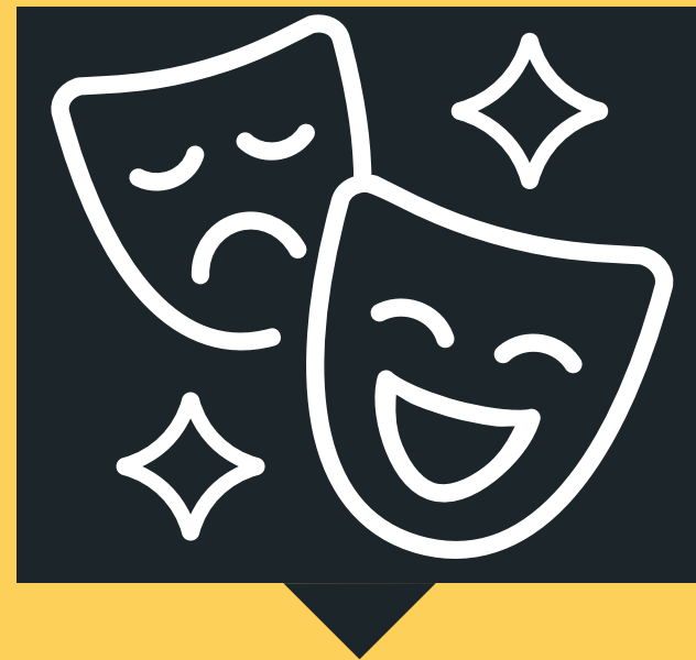
Drama and Imagination