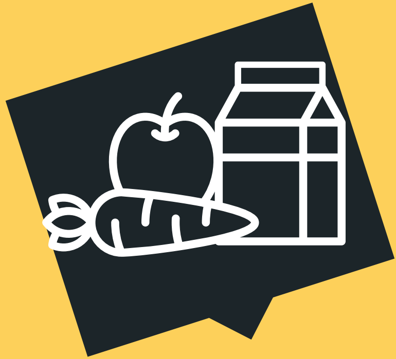
Food and Nutrition